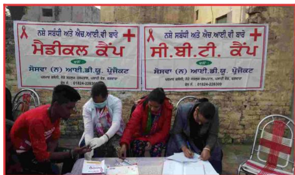
Community Based Testing Camp, Phagwara

Service was provided to 969 FSWs against a target of 830. Besides, against the target of 200 MSMs 263 were taken on roll and provided necessary services. The target for the year for IDUs was 600 against which 633 were registered.