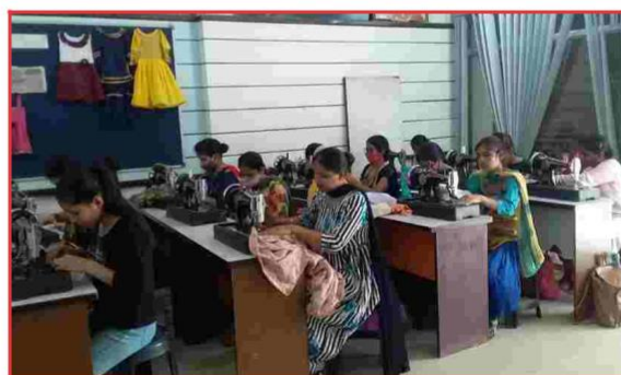
Sai Training Institute Rajpura- Cutting Tailoring Class