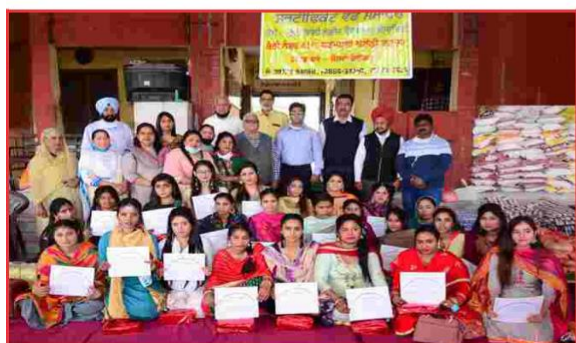
Rani Jhansi Ladies Welfare Society Batala- Distribution of Beauty Kits.