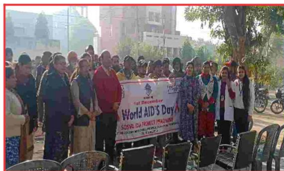
World AID'S Day Celebration, Phagwara